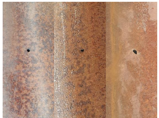
Cased hole: 7" GRE cemented in 9 3/8" casing